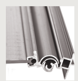
Thick Extruded Solid Aluminium Panel