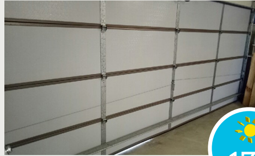
insulated garage door