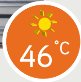
Surface Temperature Reading