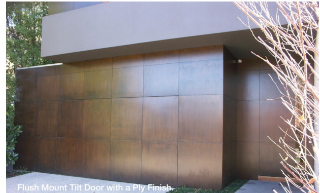
Flush Mount Tilt Door with a Ply Finish