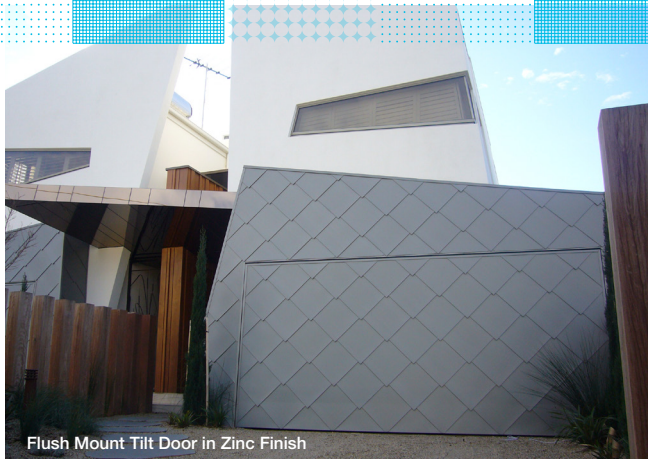
Flush Mount Tilt Door in Zinc Finish