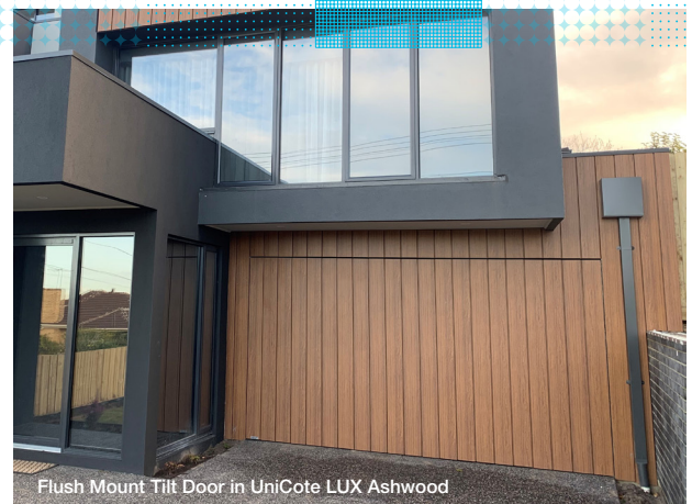
Flush Mount Tilt Door in UniCote LUX Ashwood