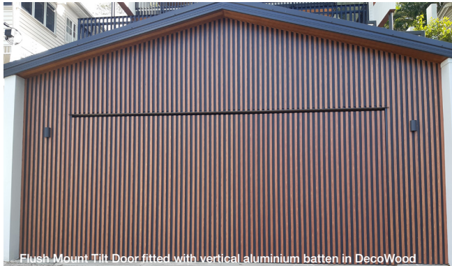
Flush Mount Tilt Door fitted with vertical aluminium batten in DecoWood