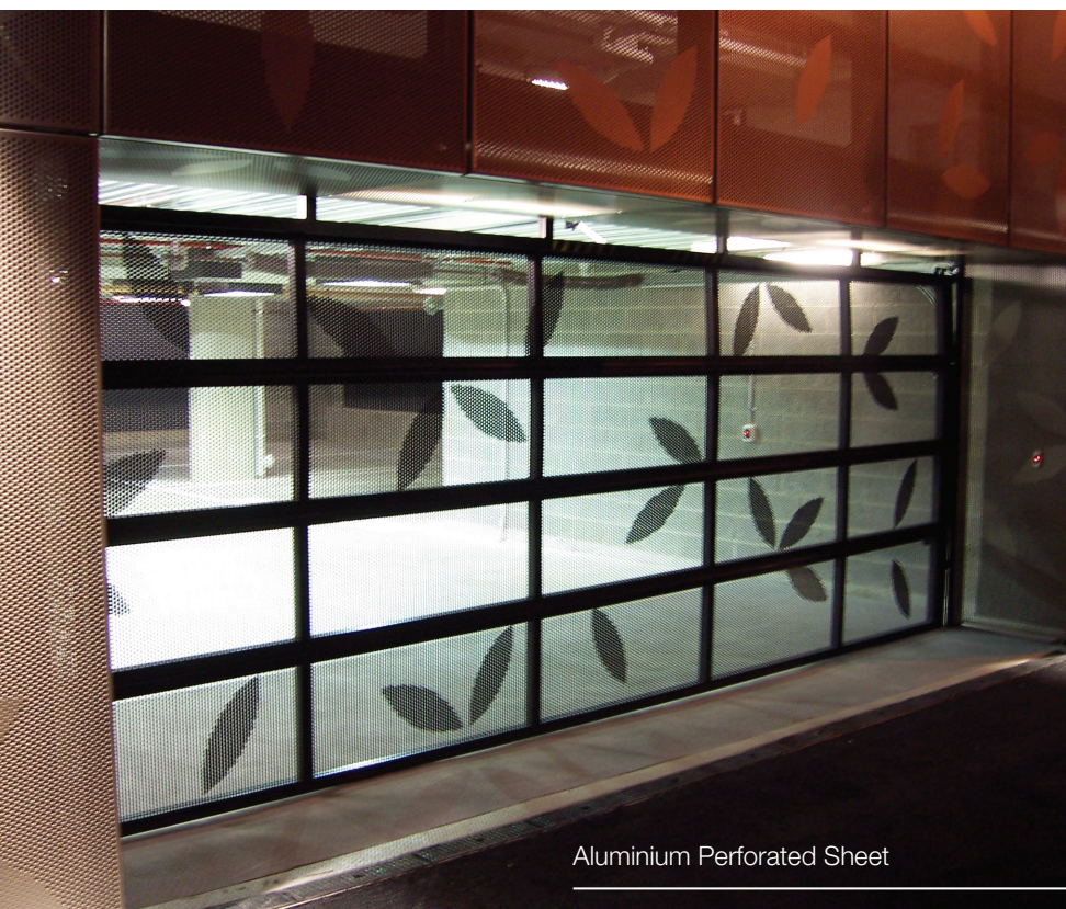
Aluminium Perforated Sheet