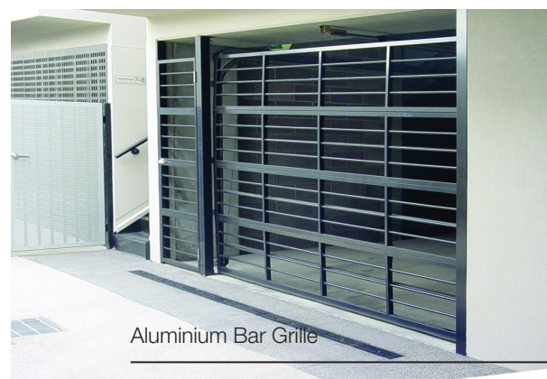
Aluminium Bar Grille