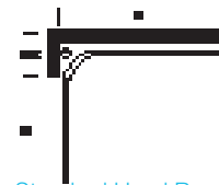
Standard Head Room